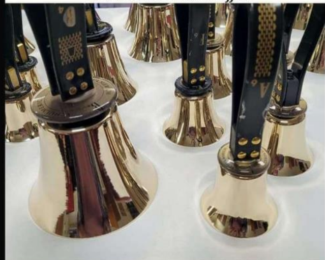
Charles Town Presbyterian Church

No music or ringing skill required! Please contact Penny for more info Or to Sign-up Penfylvfarm@aol.com 304-725-5316 Church office